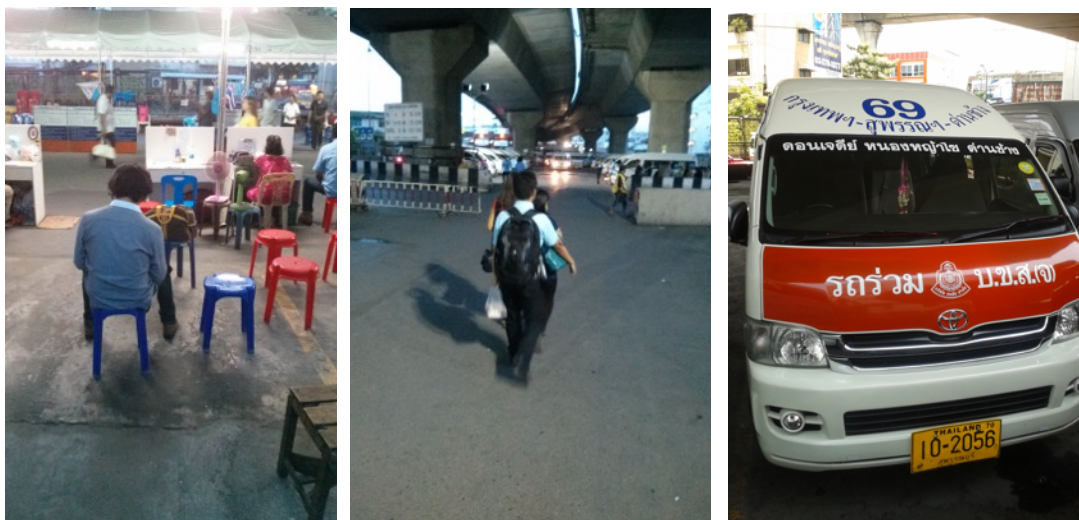
Figure 5: Waiting area, passengers walking to the van, and the van number 69

<Group of 2 people or more> The van can drop you off at Wat Trivisudhidham if there are 2 people or more going there. Tell the ticket seller that you would like to get off at 'Wat Trivisudhidham' (200 Baht/ person).