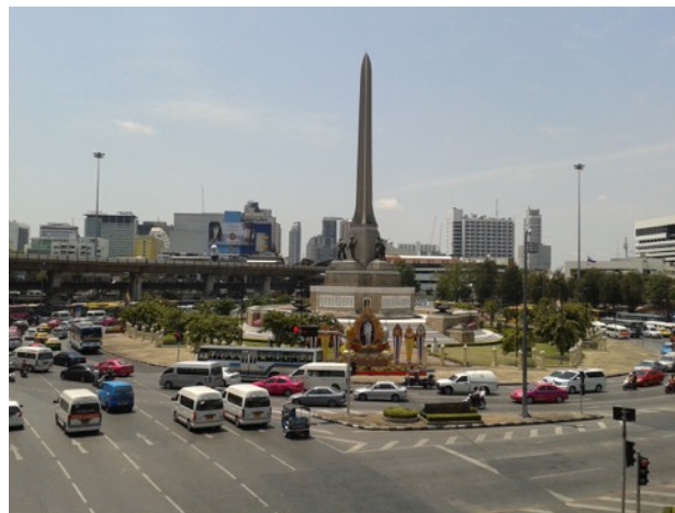
Figure 3: Victory Monument

Reaching the Victory Monument (see Figure 3).