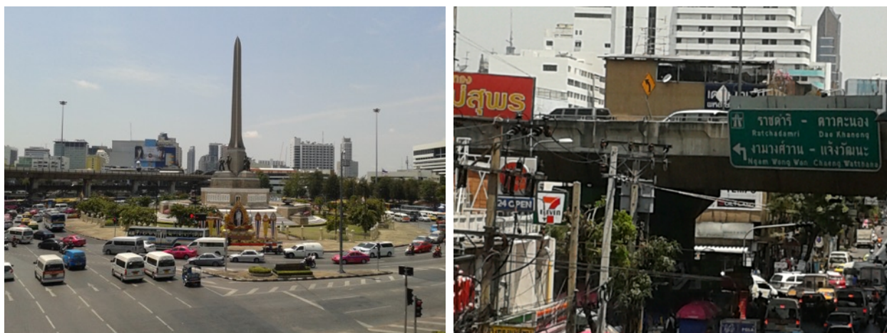
Figure 1: Victory Monument ( left image ) and Express Highways cut across and behind the Victory Monument ( right image )

The journey starts from the 'Victory Monument' where the hub for the van is situated (see Figure 1).