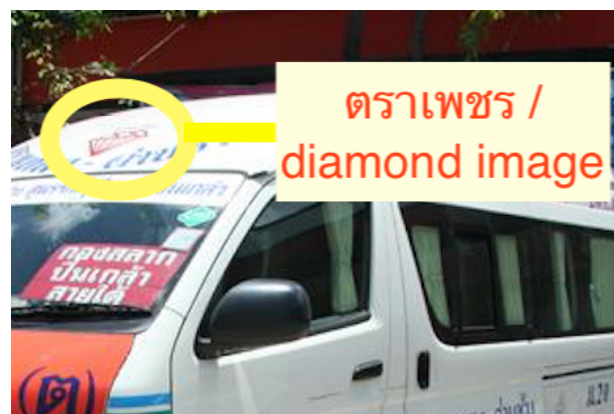
Figure 2: The van with the red diamond image in front of it.