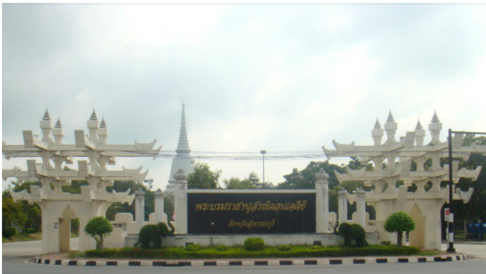
Figure 7: Entrance to 'Don Jedi Monument'

After around two hours, you should see 'Don Jedi Monument ' on your right hand side as a marking point (see Figure 7). <1 person> You should remind the van driver that you would like to get off at 'Yak Tarlay Bouk'. <Group of 2 people or more> Do nothing. The van will continues for another 10 minutes before reaching 'Yak Tarlay Bouk'.