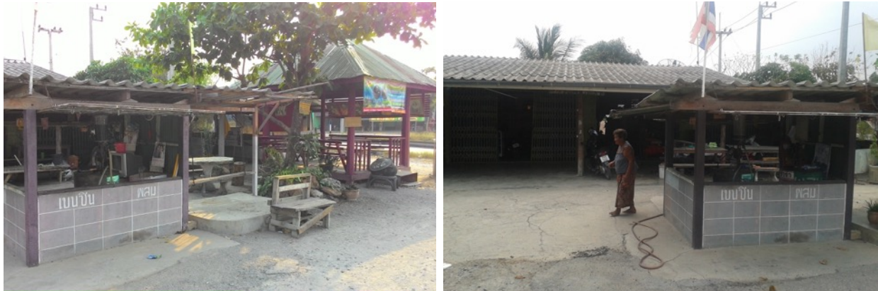
Figure 8 : Small green shelter and small local petrol station

<Group of 2 people or more> Don't get off the van at 'Yak Tarlay Bouk'.