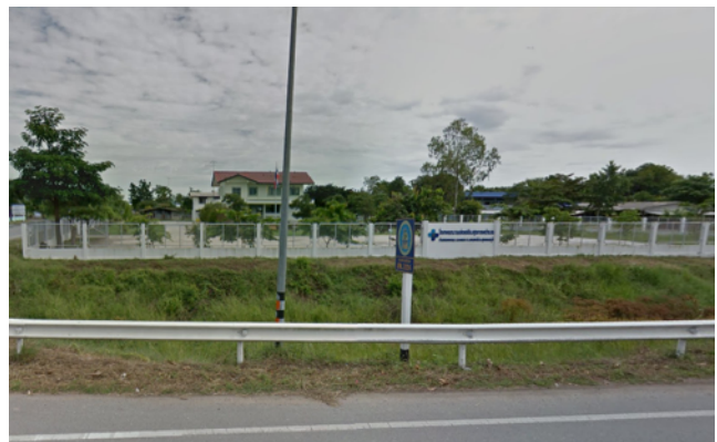
Figure 1: Small green shelter and a small local petrol station (left image), and a local hospital (right image)