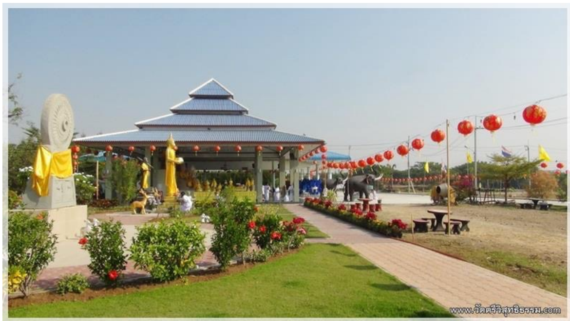
Figure 9: Wat Trivisudhidham

Once you see the blue roof from distance, it means you have finally reached the temple (see Figure 9).