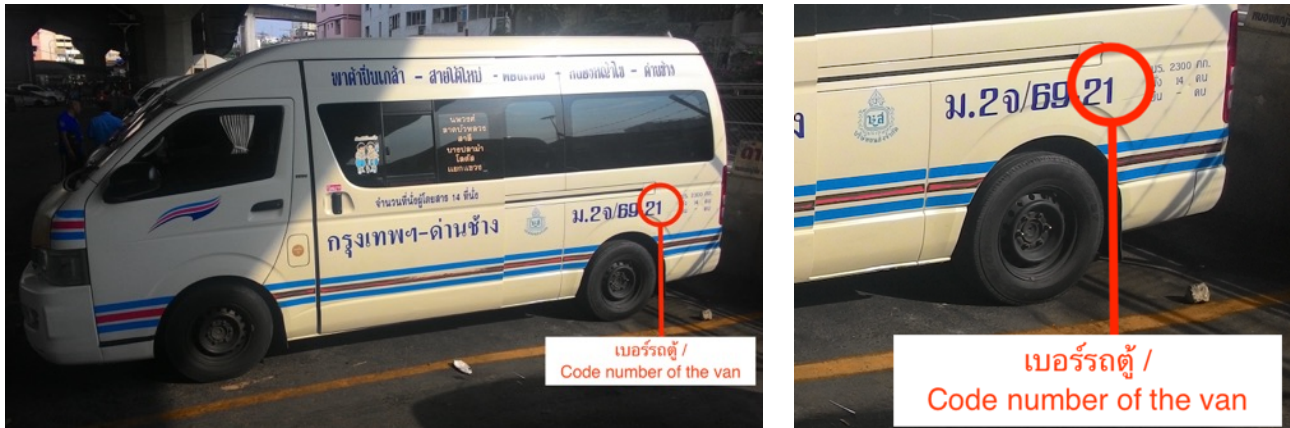
Figure 2: Code number of the van

The van number 69 will pick you up at the Mother Earth Squeezing Her Hair image. Be sure to take the van with the correct code number (see Figure 2). The fare is 200 Baht/ person.