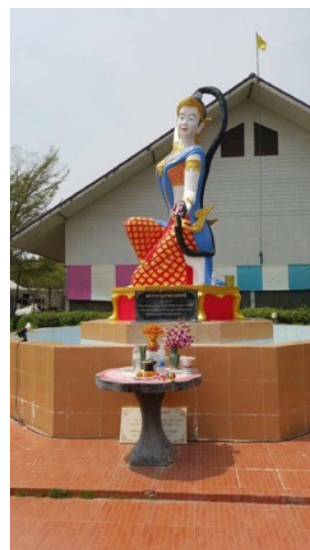
Figure 1: The Mother Earth Squeezing Her Hair image

After the call, you have to be ready at the 'Mother Earth Squeezing Her Hair image' (see Figure 1).