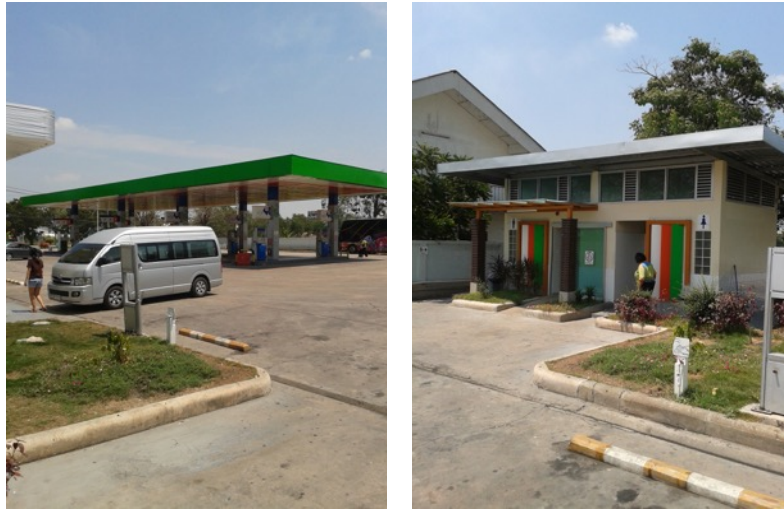
Figure 6 : Quick pit stop allows you to visit the toilet.

After around two hours, you should see 'Don Jedi Monument ' on your right hand side as a marking point (see Figure 7). <1 person> You should remind the van driver that you would like to get off at 'Yak Tarlay Bouk'. <Group of 2 people or more> Do nothing. The van will continues for another 10 minutes before reaching 'Yak Tarlay Bouk'.