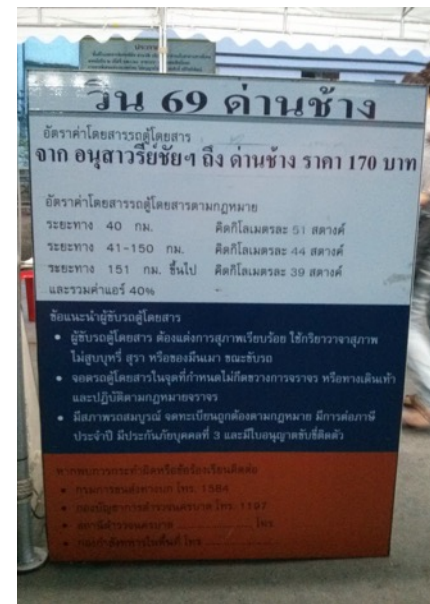
Figure 4: Ticket booth