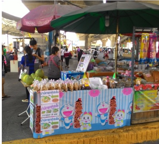
Figure 3: Under the express highways

Under the express Highways, you will find many stores (see Figure 3).